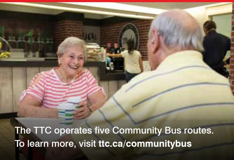
The TTC operates five Community Bus routes. To learn more, visit ttc.ca/communitybus